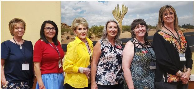
2023 Executive Committee NMFRW

This is definitely worth seeing more than once.